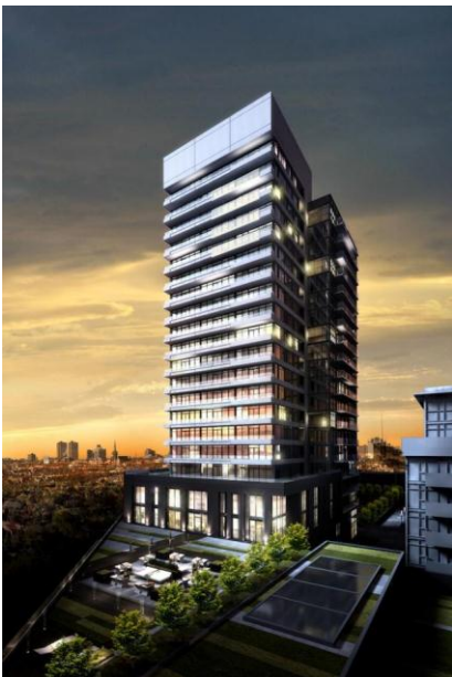
The Carnaby by Tact Design for Streetcar Developments, image by Craig White

UrbanToronto's dataBase entry for The Carnaby, linked below, includes many renderings highlighting the building's common amenities and architecture, along with all the info and links needed for further exploration.