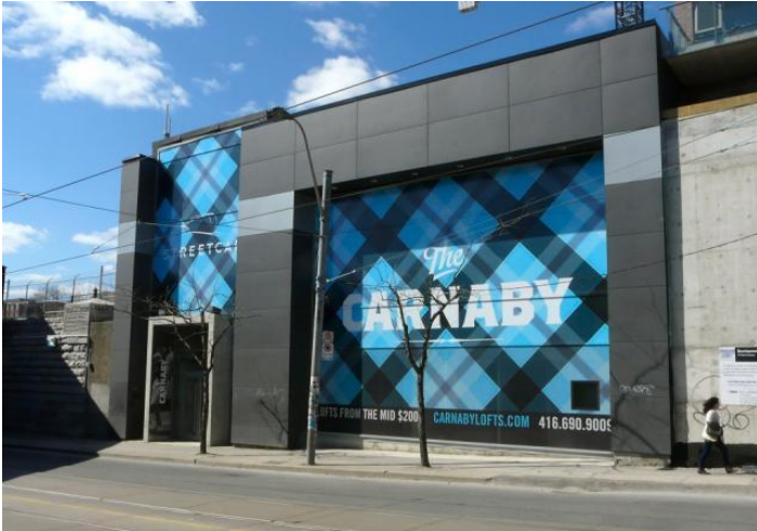
The Carnaby presentation centre by Tact Design for Streetcar Developments

The presentation centre for The Carnaby features more than just the scale model of course: two model suites decorated by Seven Haus have lots of ideas for sophisticated urban living and show off the project's integrated European appliances and cabinetry.