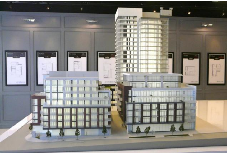
Scale model of The Carnaby: it will rise behind 2 and 8 Gladstone

Let's back out a bit: from the southeast we see the complex, with Queen Street West in front and Gladstone Avenue along the right side.