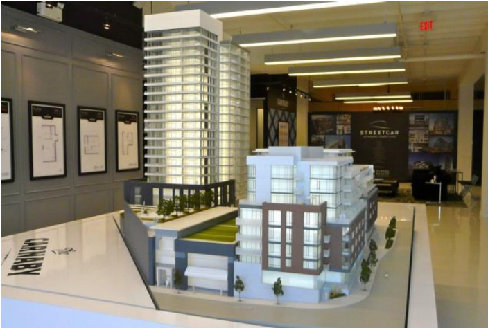
Scale model of The Carnaby: it will rise north and west of 2 and 8 Gladstone

Let's back out a bit: from the southeast we see the complex, with Queen Street West in front and Gladstone Avenue along the right side.