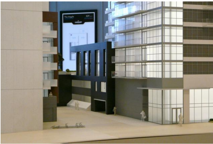
Scale model of The Carnaby: laneways will favour pedestrians between the buildings

From the north we can see that more space separates the new and earlier phases east-to-west. Below, we take a closer look.