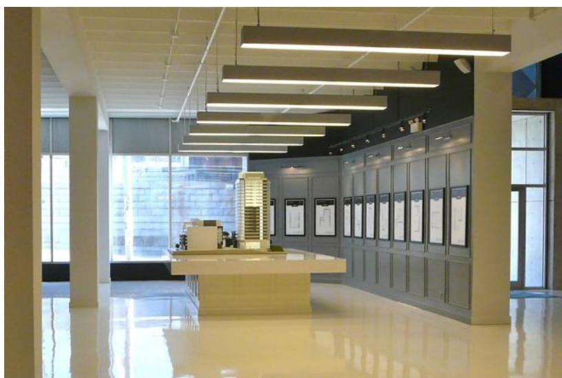
The Carnaby presentation centre by Tact Design for Streetcar Developments

Metro will follow through to Queen Street, with a door there too, one which currently serves as the presentation centre's entrance. Above that will be a green roof covering part of the store, while much of the roof will be given over to The Carnaby's outdoor terrace amenity.