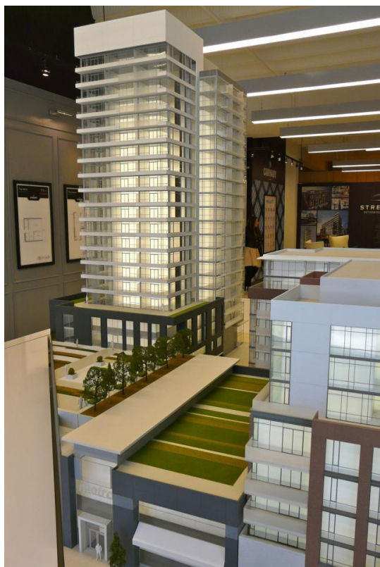
Scale model of The Carnaby: laneways will favour pedestrians between the buildings

Metro will follow through to Queen Street, with a door there too, one which currently serves as the presentation centre's entrance. Above that will be a green roof covering part of the store, while much of the roof will be given over to The Carnaby's outdoor terrace amenity.