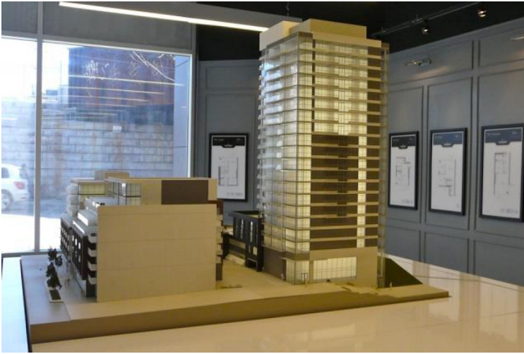
Scale model of The Carnaby: laneways will favour pedestrians between the buildings

From the north we can see that more space separates the new and earlier phases east-to-west. Below, we take a closer look.