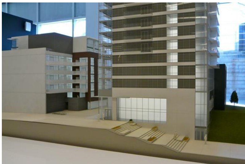
Scale model of The Carnaby: broad stairs will connect laneways to Dufferin and a grocery store

The laneway will drop as it moves west towards Dufferin Street across a broad staircase.